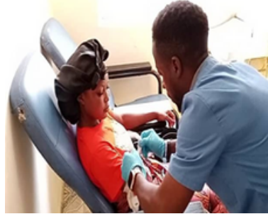
Preparing for blood donation