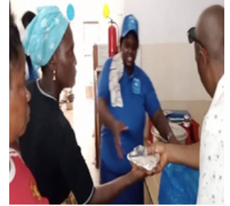
Healthy Food Donation to blood donors and breast feeding and lactating mothers

Moreover, upon returning home from Utah, I established the Sierra Leone Chapter of the J. Reuben Clark Law Society (JRCLS), where I serve as Chairperson.