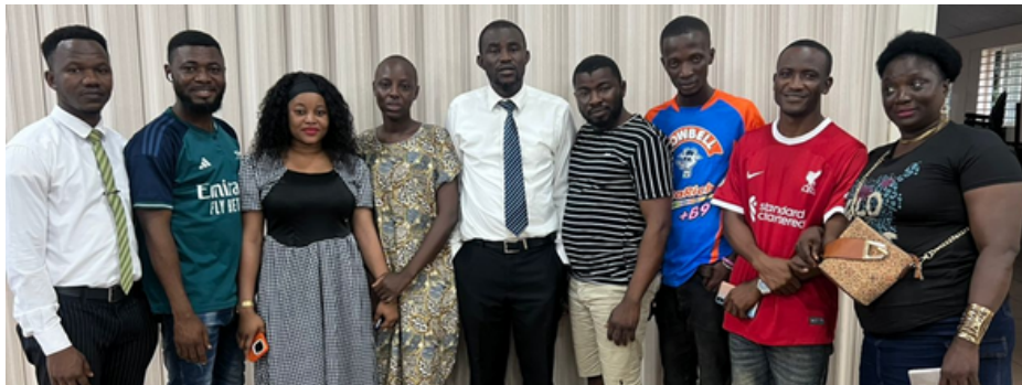
Cross Session of the JRCLS Sierra Leone Chapter

Also see visit to the Chief Justice to foster a meaningful relationship and possibly help with a particular issue we can identify and work on together as part of a collaborative effort to support in strengthening the Sierra Leone legal system.