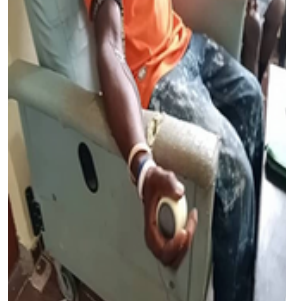
Blood drive donation for sick people in the Government Hospital